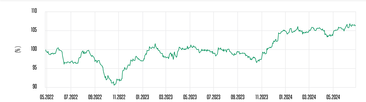
Cumulated Performance at 28.06.2024 (%)

(1) All figures net of fees (in USD). (2) Based on 360 days