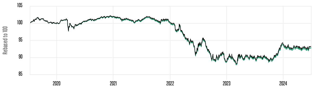
Cumulated Performance at 28.06.2024 (%)