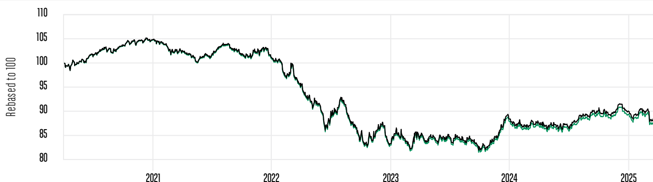
Cumulated Performance at 31.03.2025 (%)