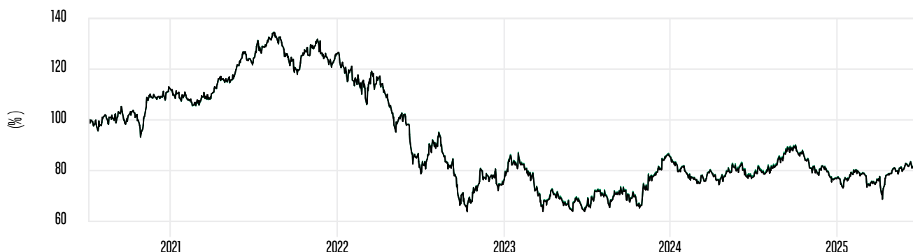
Cumulated Performance at 30.06.2025 (%)