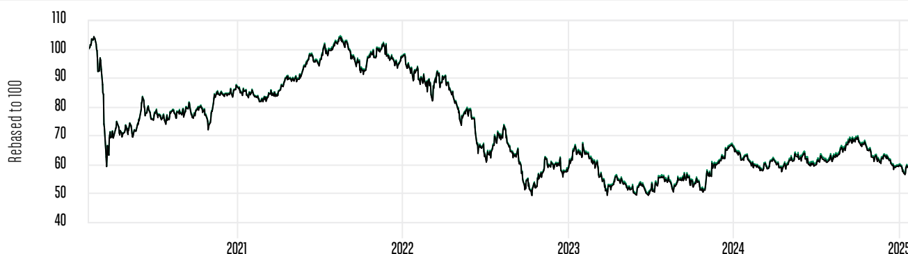
Cumulated Performance at 31.01.2025 (%)