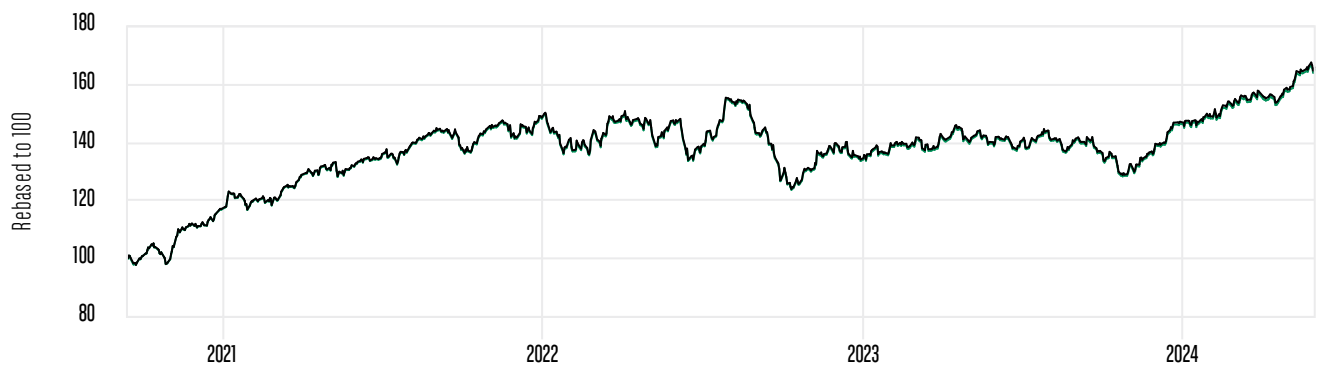
Cumulated Performance at 31.05.2024 (%)