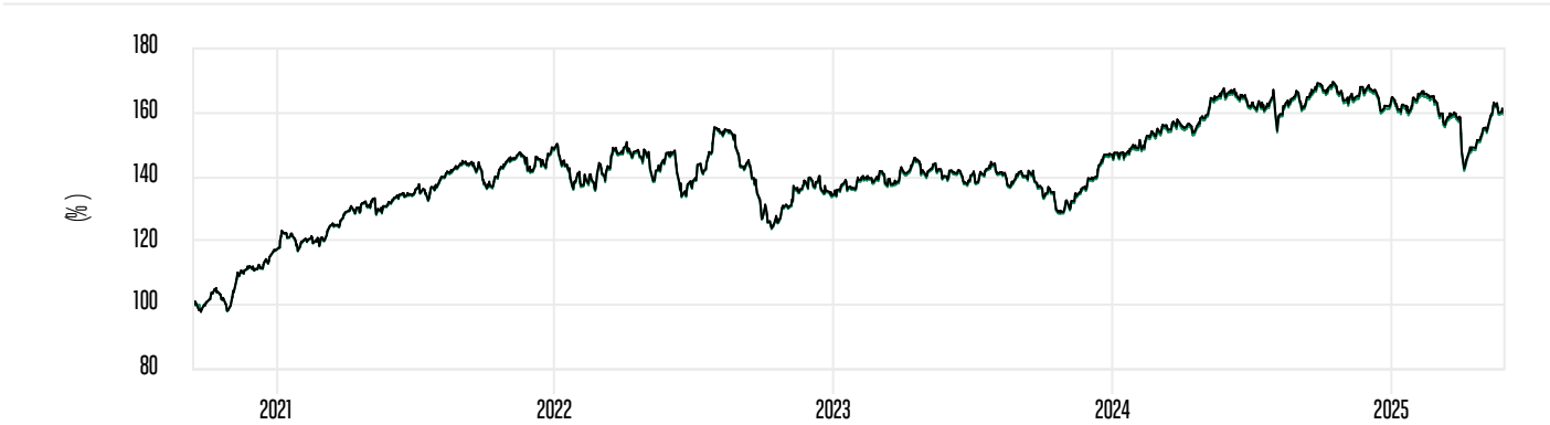
Cumulated Performance at 30.05.2025 (%)

The Index is composed of companies that are best placed to seize the opportunities offered by the sustainable use of ocean resources (coastal protection, eco-tourism, recycling, human capital, corporate governance, etc.), with a positive Environmental, Social and Governance (ESG) rating. As a result, companies involved in sectors with a potentially high negative ESG impact, those subject to significant violations of the UN Global Compact principles and those involved in severe ESG-related controversies are excluded from the Index. The type of approach implemented here is thematic (the Index is composed of companies that provide products and services proving concrete solutions to specific environmental and/or social challenges, seeking to benefit from future growth anticipated in these areas while contributing capital to the transition towards a low-carbon, inclusive economy). The extra-financial strategy of the Index may comprise methodological limitations such as the risk related to ESG investment or the Index rebalancing. Further information on the Index, its composition, calculation and rules for monitoring and periodic rebalancing, as well as information on the general methodology common to all ECPI indices, can be found at www.ecpigroup.com . The Comparison Index is the MSCI World (USD) NR