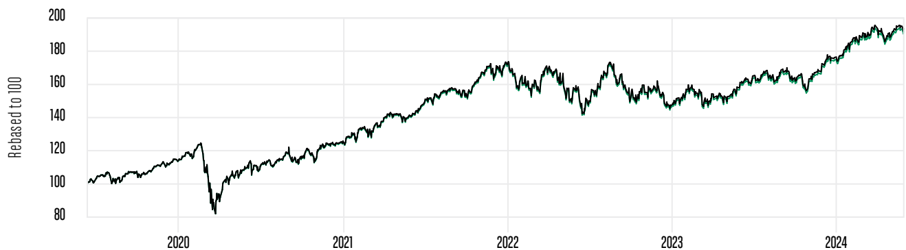
Cumulated Performance at 31.05.2024 (%)