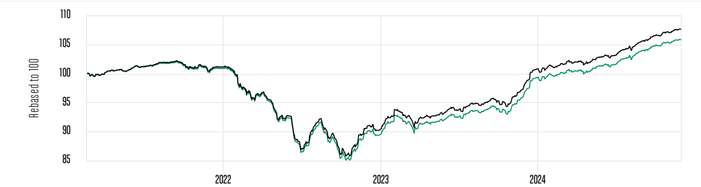
Cumulated Performance at 29.11.2024 (%)