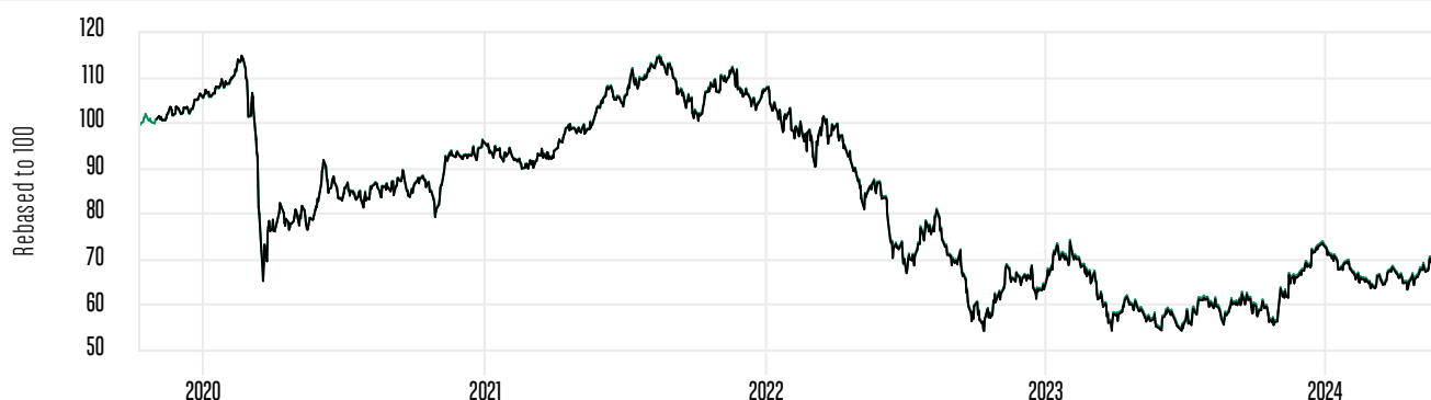
Cumulated Performance at 31.05.2024 (%)