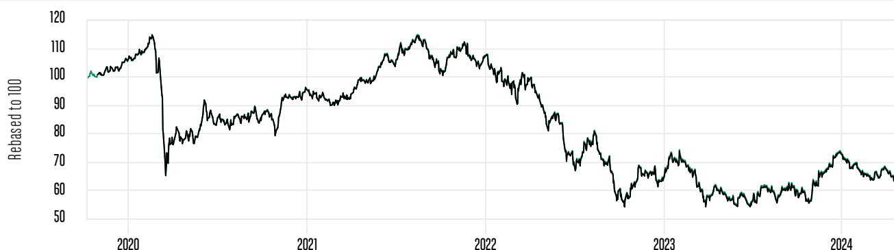
Cumulated Performance at 30.04.2024 (%)