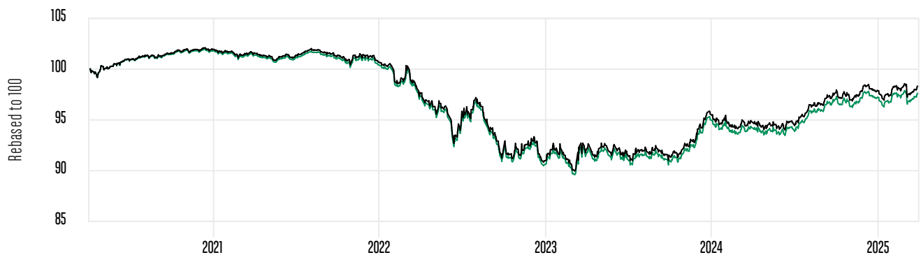
Cumulated Performance at 31.03.2025 (%)