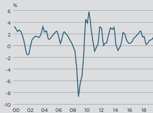
Figure 2: Economic Development (GDP) in Japan

Based on the Japanese experience, slow economic growth is the likely scenario – see figure 2. Japan has had periods of economic growth around zero and close to full employment. A recession – stagnation – is not such a big thing in Japan. Maybe that is a new normal for most of the world?