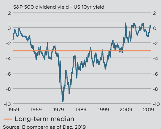
Figure 3: Yield difference

All opinions constitute the judgment of the document’s author at the time specified and may be subject to change without notice.