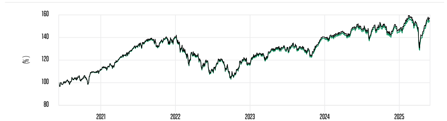
Cumulated Performance at 30.05.2025 (%)

INDEX DESCRIPTION: The Index is composed of shares of European companies selected on the basis of profitable business models and good financial health, while taking into account an Environmental, Social and Governance (ESG) criteria (reduction of carbon emission, human capital, corporate governance etc.). Hence, companies involved in disputable activities, subject to significant violations of the principles of the United Nations Global Compact or companies that have been involved in serious controversies related to the ESG are excluded from the index. The type of approach implemented here is Best-in-class (Best-in-class approach identifies leaders in each sector based on the best environmental, social and governance (ESG) practices, while avoiding those that present high levels of risk and do not comply with minimum ESG standards). The extra-financial strategy of the Index, carried out at each step of the investment process, may comprise methodological limitations such as the risk related to ESG investment or the Index rebalancing. Further information on the Index, its composition, calculation and rules for periodical review and rebalancing and on the general methodology behind the BNP Paribas indices can be found on https://indx.bnpparibas.com . The Comparison Index is the STOXX Europe 600 (EUR) NR