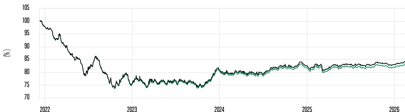
Cumulative performance at 27.02.2026 (%)