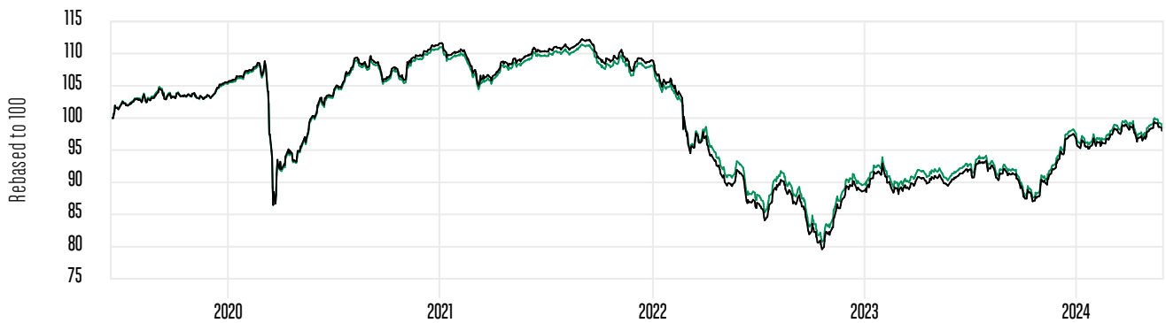
Cumulated Performance at 31.05.2024 (%)