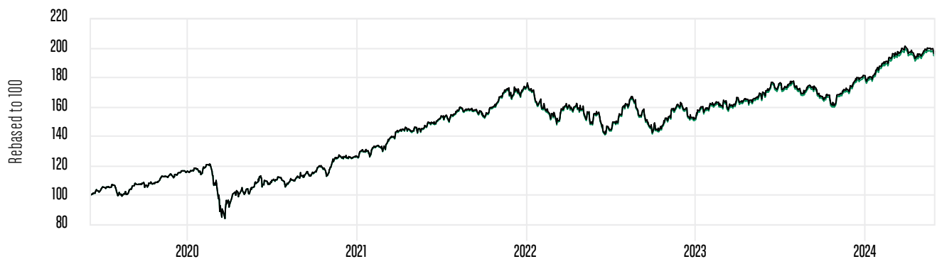
Cumulated Performance at 31.05.2024 (%)