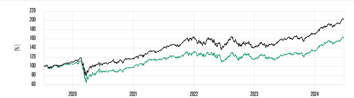
Cumulated Performance at 28.06.2024 (%)

(1) All figures net of fees (in EUR). (2) Based on 360 days