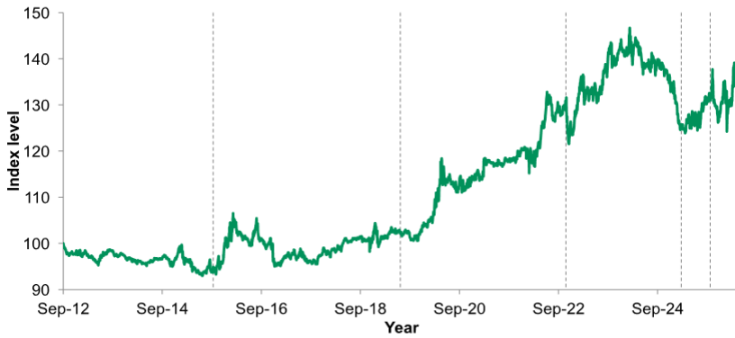
Historical Performance (net of fees, Share I - USD)