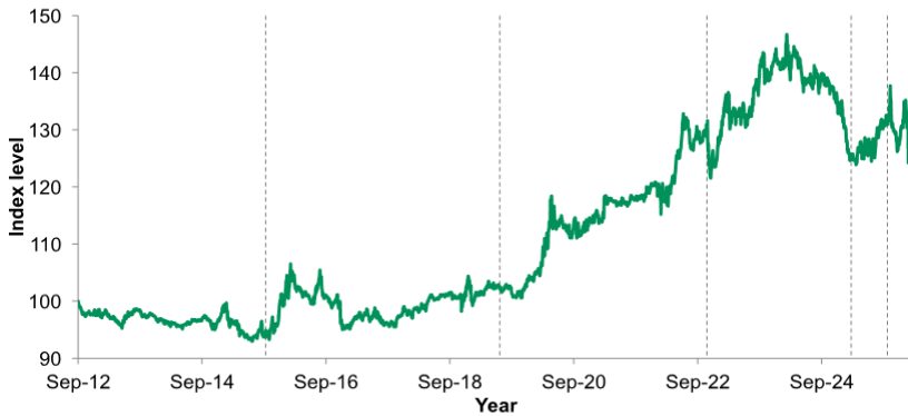
Historical Performance (net of fees, Share I - USD)