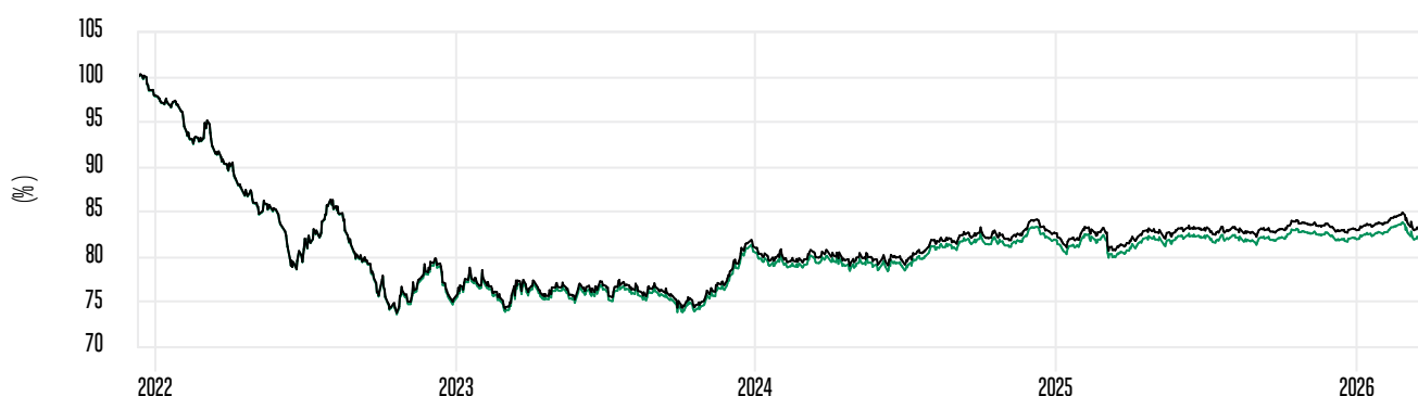
Cumulative performance at 31.03.2026 (%)