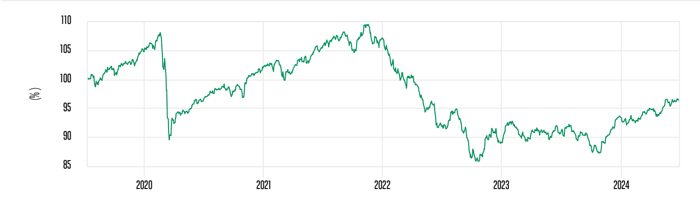
Cumulated Performance at 28.06.2024 (%)

History shows that volatility tends to rise as markets fall, and fall as markets rise. We thus determine our exposure to different asset classes based on volatility signals. We reduce exposure to each asset when its volatility increase and increase its exposure when its volatility decrease. This approach improves the fund’s robustness by providing a better risk/return profile and asymmetry.