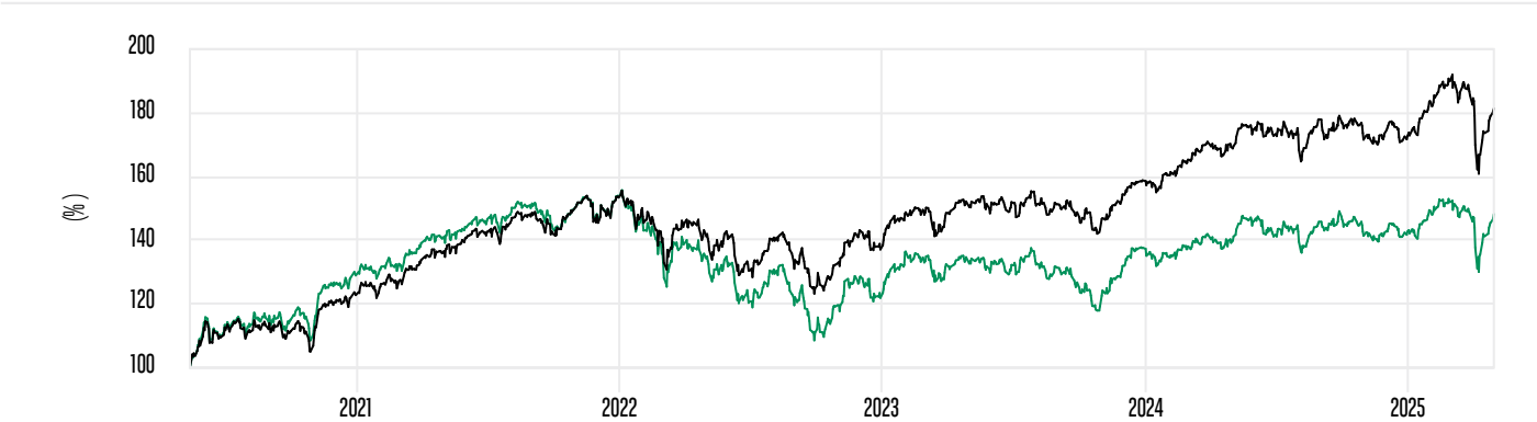
Cumulated Performance at 30.04.2025 (%)